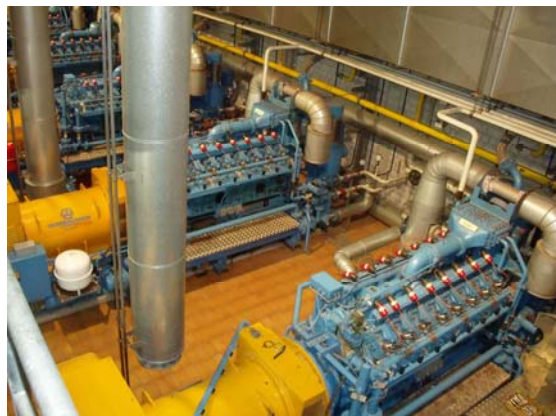
Photo: Inside view of the CHP Friesenheim. This installation of the badenova WÄRMEPLUS is one of the showcases elaborated within the project “MASSIG”. ©badenova

Graphic: The EU project “MASSIG” (Market Access for Smaller Size Intelligent Electricity Generation) investigates technical and economic concepts for market access of distributed energy generators. ©Fraunhofer ISE